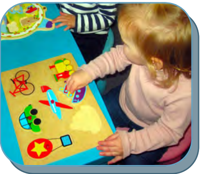
Scarlett completing a transport puzzle