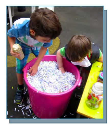
Rafferty & Otis digging deep in to the lucky dip searching for a prize