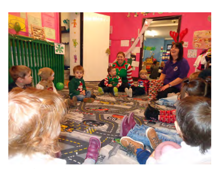
Pass the parcel