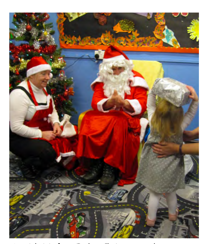
Special visit from Father Christmas at the Nursery