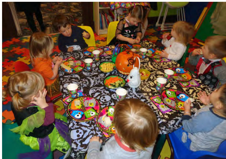
Having a fang-tastic time at the Halloween Tea Party