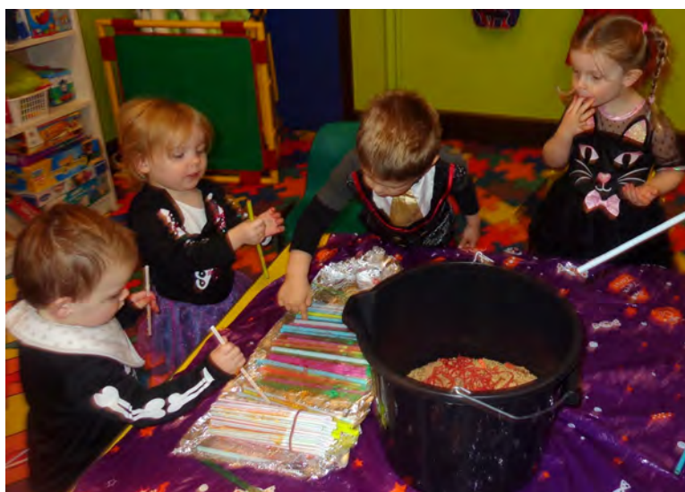
Squeezing Jelly worms from straws