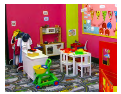
Role play home corner/kitchen area.