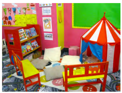
Cosy book corner

If you are interested in booking a funded place please ask a member of staff for a registration form.