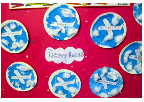
The babies made individual aeroplanes to go on Tracey's display board.