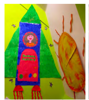
Buttons Rocket & Sun