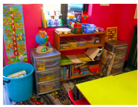
Area for painting, stencilling, stamping & chalking to name but a few