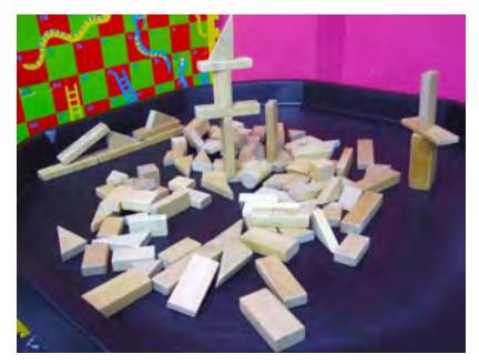
Construction area for building